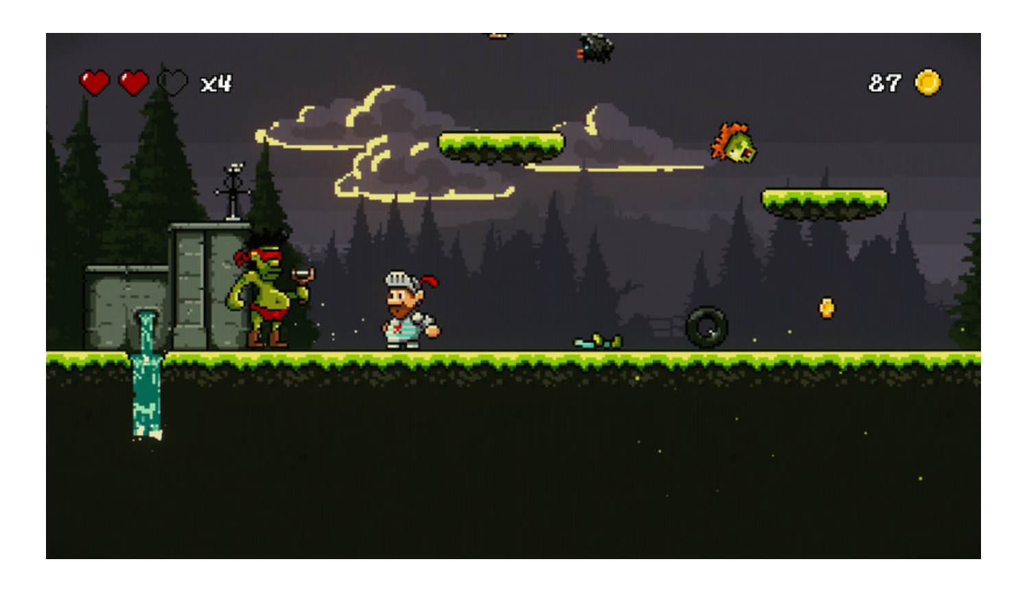
Sigi - A Fart For Melusina Activation Code And Serial Key For Pc